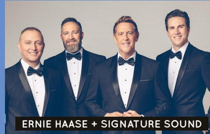
ERNIE HAASE + SIGNATURE SOUND