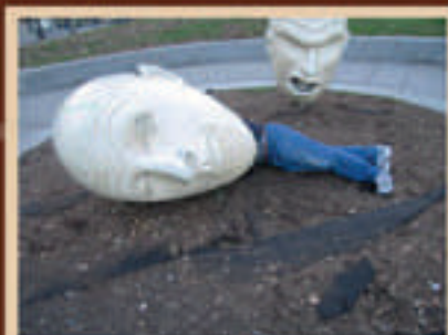
Royce sleeps with one eye open