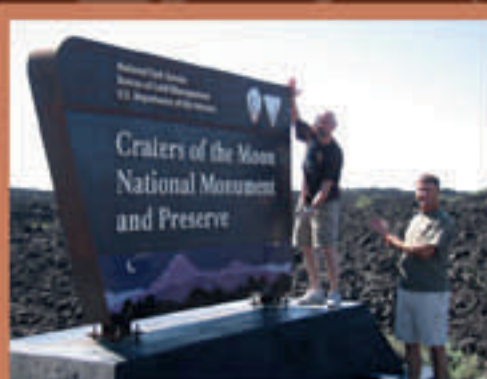
Yeah, we get around. Out of this world!