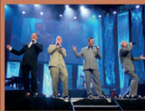
Singing on Wednesday night at Fan Festival