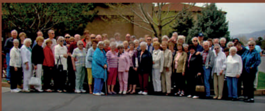
We had two buses from the Boise area even though passengers came from other northwestern states. You have to join us in 2010!