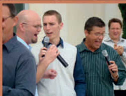
Liberty hosted the Saturday morning outdoor breakfast - we had a fantastic time!