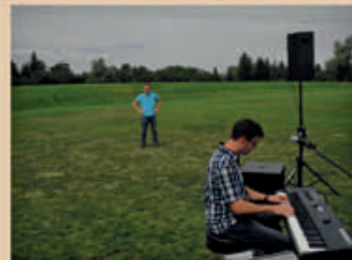
This is not a posed shot. We were really out in the middle of, well, nowhere. We really do sing everywhere.