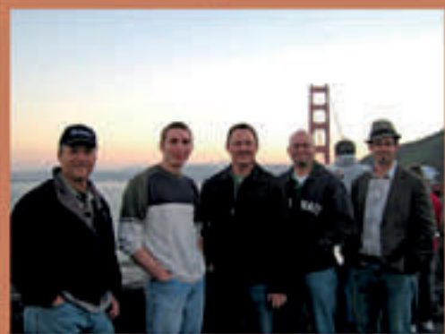
We visited the Golden Gate Bridge for the first time. Very cool!