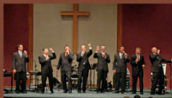
The concert ended with both groups singing "Champion of Love"