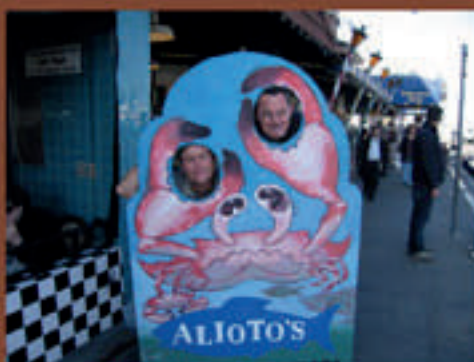
Liberty's "crabby" old men