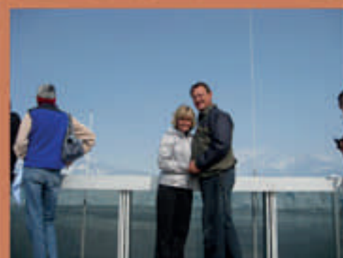
Quite the lovely couple, don't you think?