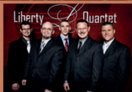
We posed for a group shot at Oro Valley (AZ) Nazarene