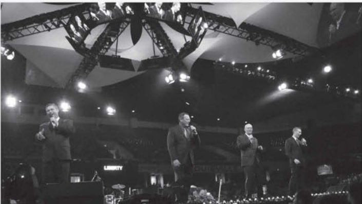
We were honored to be one of the featured artists at the 2010 National Quartet Convention in Louisville, KY in September.