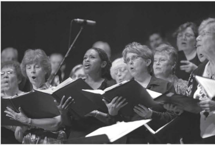
Over 100 choir members added their talents to the Family Fest concert.