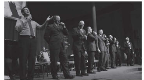
The entire group sang a few songs.