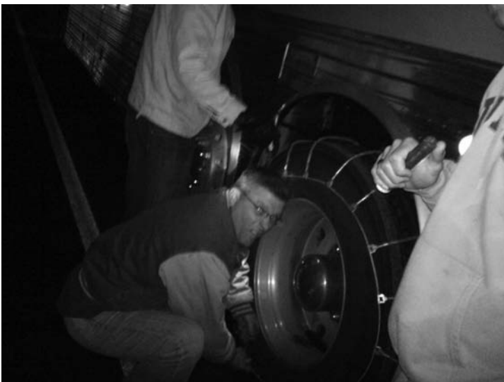
There's nothing like putting chains on the bus tires in a snowstorm. We've had to do this three times in recent weeks. Now you know why we head south for the winter. We're smarter than we look.