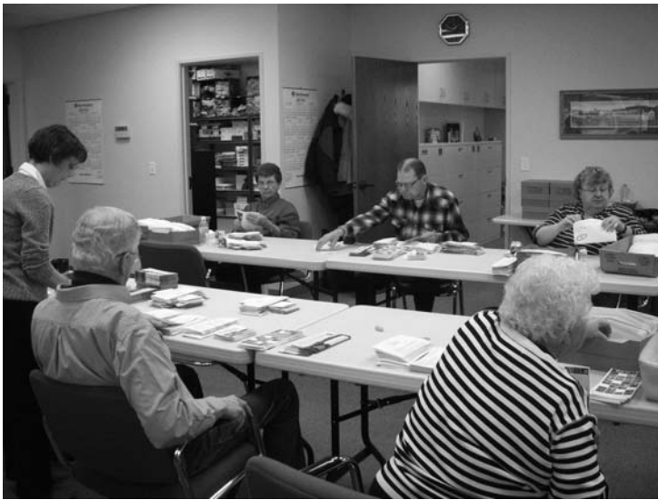
We had an awesome team of volunteers help in getting out our end-of-the-year mailing. Thanks a million!